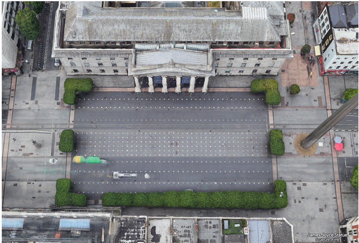
James Joyce Statue Sculpture of the Irish writer James Joyce